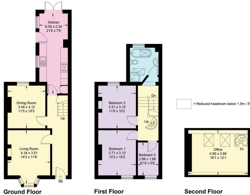
Illustration for identification purposes only, measurements are approximate, not to scale. floorplansUsketch.com © (ID1115330)